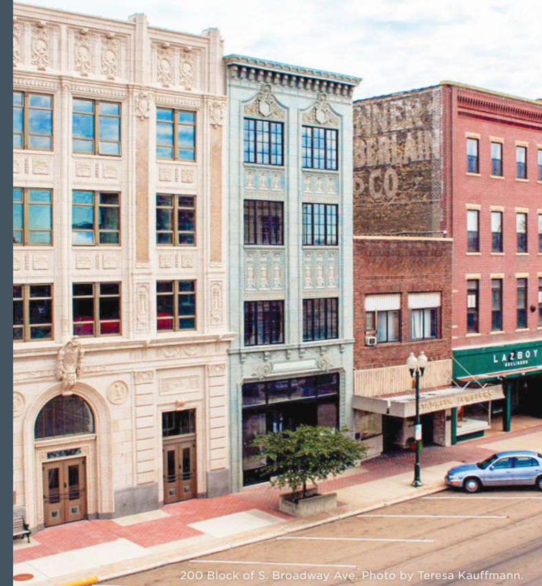
200 Block of S. Broadway Ave.

The 37th Annual Statewide Historic Preservation Conference